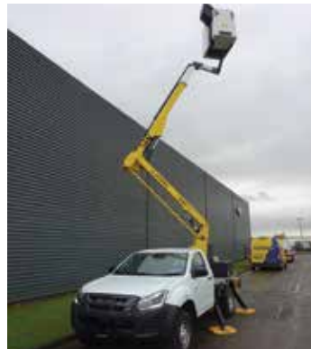
Fitted with LV insulation as standard, the LAT135-H E6 features a stronger, lighter boom and a re-engineered pedestal.