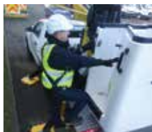
Safe access to bucket from vehicle