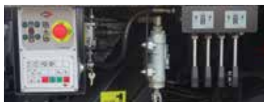
Hydraulic, 12V DC emergency ground controls and emergency hand pump