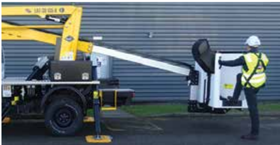
Safe access to bucket from ground