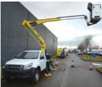
An industry leading 500kg of payload* when mounted on an Isuzu D-Max