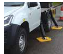
Double A-frame outriggers (front + rear) for narrow, compact set-up