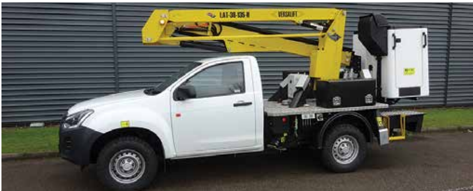
Low travel height