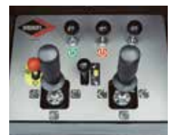
Easy to use fully hydraulic proportional control